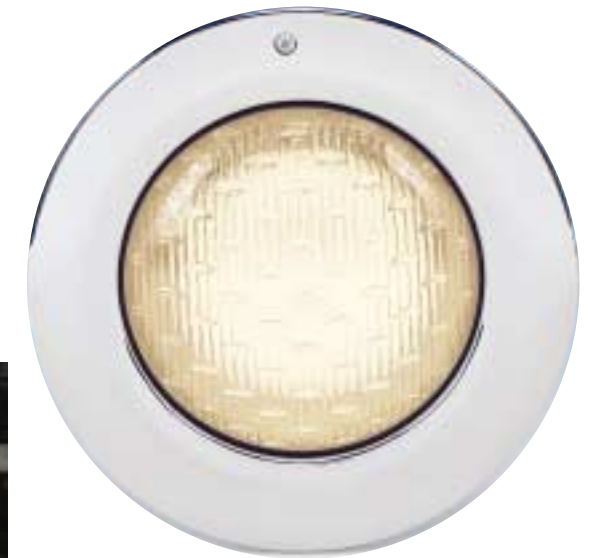
AstroLite Series light fixtures are available in a choice of face rim designs — from patterned thermoplastic (top) to smooth stainless steel (bottom).