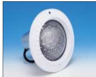
SP0580 Series Outside diameter of face rim: 10-3/4"

Models with suffix "L" are equipped with Automatic Thermal Switch (ATS). AstroLite Series light fixtures mount into DuraNiche Series niches only.