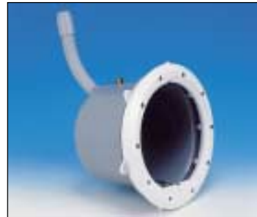
SP0607U Maximum O.D. of shell back: 10-5/8" O.D. of shell flange: 12-3/16"