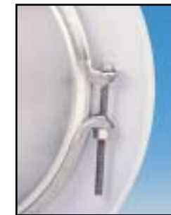
E-Z Lock clamp and reflector assembly.

They feature a convenient E-Z Lock™ clamp and reflector assembly for simple relamping. And, they come standard in a wide range of voltages, wattages and cord lengths to satisfy virtually any installation.