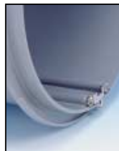
3/4" plaster flange with 90° "no slump" ledge.

For gunite and concrete pools, DuraNiche features a 3/4" set-back plaster flange with tie-off holes to secure to re-bar. This allows positive positioning of the niche during guniting and ensures a professional appearance in the pool wall. A cover-up plate is provided to protect the niche and mounting threads during guniting. Plus, a unique 90° ledge at the bottom of the flange prevents "slumping" during plastering.