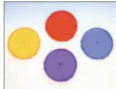
SP0580L Selecta-Color™ Lens Kit. Now change the mood of your pool at a moment's notice. Simply snap any of the four easy-to-change lens covers over the clear lens of the AstroLite fixture. No fixture removal or assembly is required.