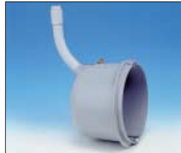
SP0600U Front-to-back: 7-15/16"