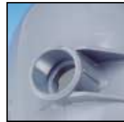
Socket conduit connection for simple gluing.

Reliability is further extended with DuraNiche's socket conduit connection. Designed for quick and simple gluing to PVC pipe, the connection provides a cleaner, more durable seal when compared to threaded-type conduit connections. Plus, the conduit hub is an integral part of the molded niche, which offers extra durability during installation.