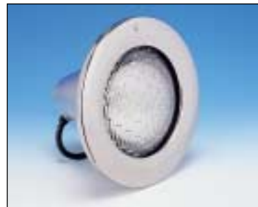
SP0580S Series Outside diameter of face rim: 10-3/4"