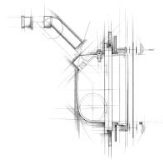
Hayward's DuraNiche Niche Series: engineered for superior performance, non-corrosive durability and plumbing versatility — plus the lowest installed cost. SP0607U DuraNiche for vinyl/ fiberglass pools (illustrated).

As the final traces of mother nature's brilliant sunshine disappear over the horizon until yet another morning, a whole new nocturnal world, full of quiet beauty and majesty drifts down from the stars and is known as nightfall.